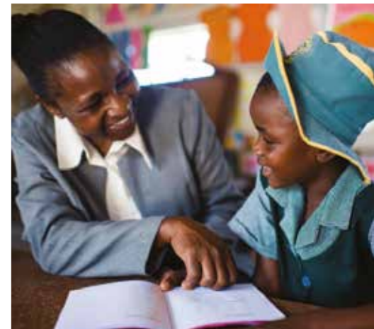
Above: Literacy unlocked – boosting reading skills in Zimbabwe.

to enlist the support of the local Council, which improves their sustainability and chances of long-term success. The Empowered World View training is Bible-based, emphasising a focus on the value of each individual, and that everyone has gifts and skills to provide for themselves.