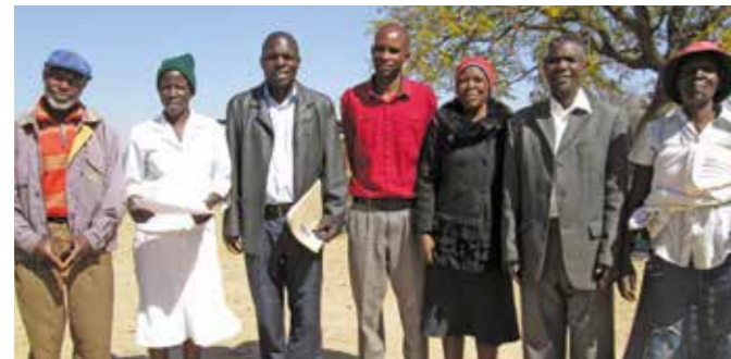
Above: Members of the Apostolic Church in Zimbabwe. The Union for the Development of the Apostolic Church in Zimbabwe Africa (UDACIZA) is a WorldVision partner church in the IGATE project which empowers girls and breaks down barriers to education, enabling completion of their school years.

WorldVision's experience of operating in Zimbabwe is positive; our Christian foundation serving as an advantage when it comes to working with religious leaders and communities who generally understand and appreciate our convictions. This is less the case for secular organisations who find it harder to engage with communities, or tackle deeply ingrained harmful practices, from a faith perspective. WorldVision enjoys the freedom to communicate our Christian roots and values clearly and openly. The high levels of Christian faith in Zimbabwe provide a platform for World Vision to work with government and church umbrella groups to create partnerships that support our common objectives for child wellbeing.