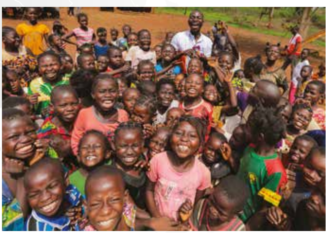
Above: Children from the Peace Club and Child Friendly Space, Damara. World Vision trained 4,940 children on peace and social cohesion including 300 former child soldiers.