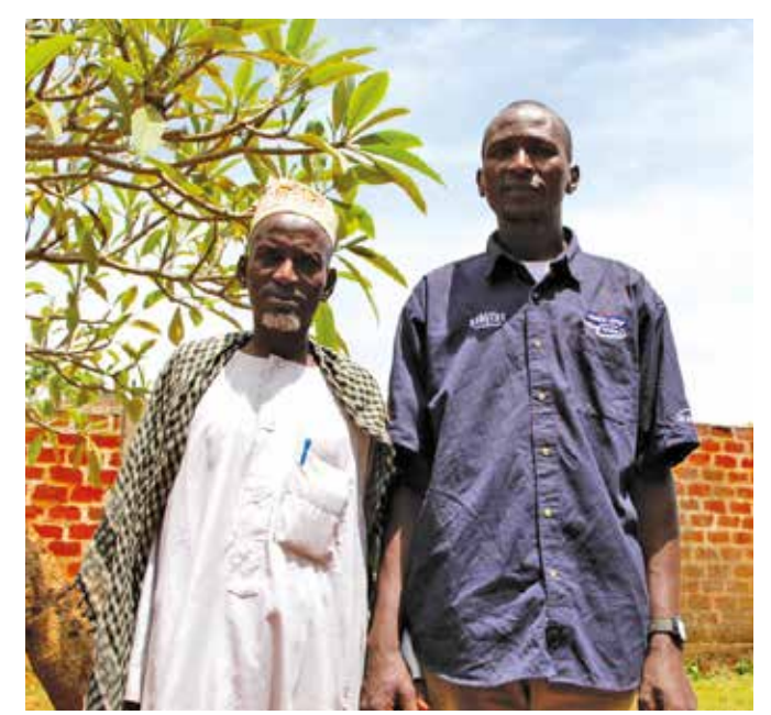
Above: Muslim and Christian leaders stand hand in hand in Yaloke, CAR, members of the Interfaith platform supported by World Vision.