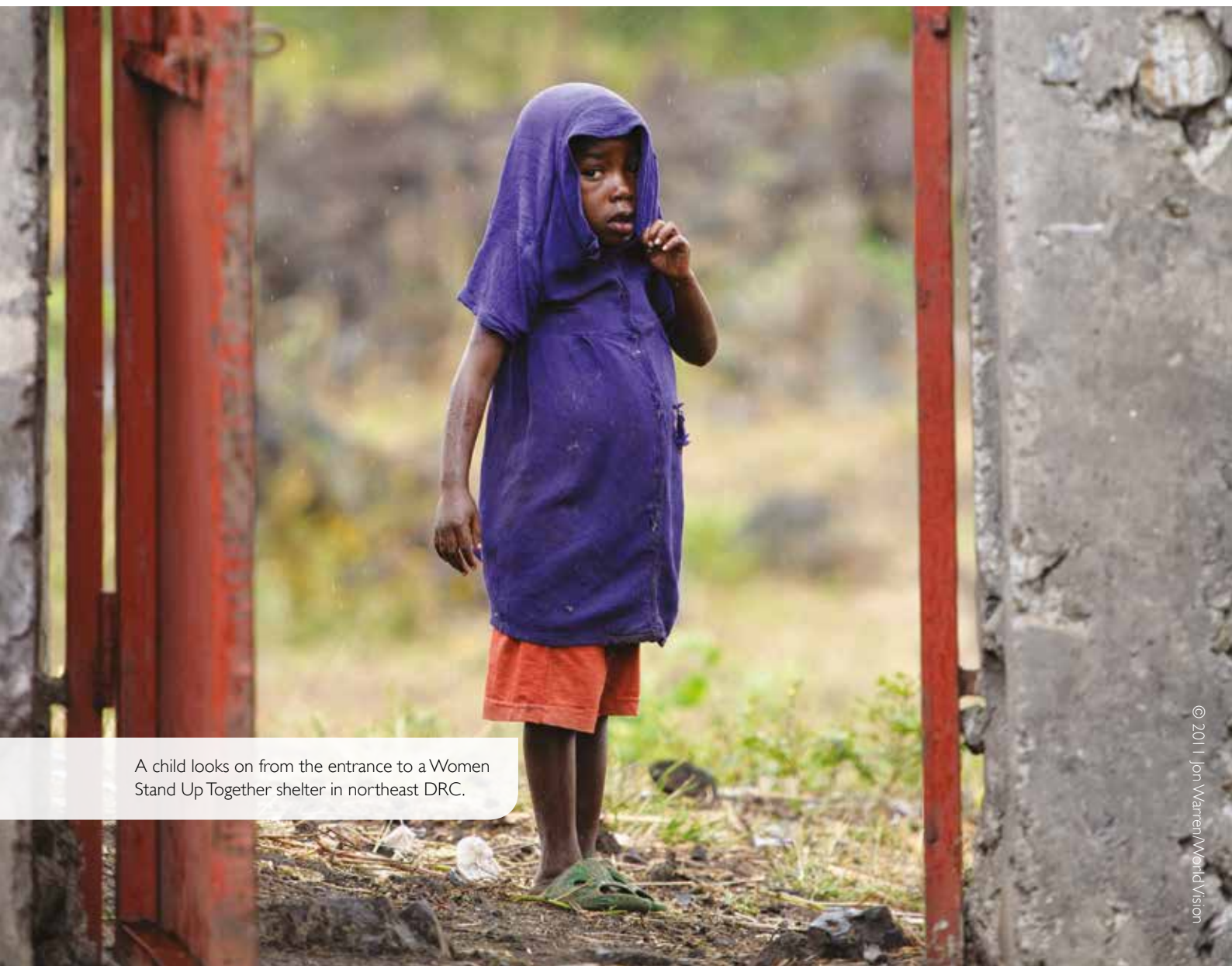
A child looks on from the entrance to a Women Stand Up Together shelter in northeast DRC.

And so the cycle of silence continues and an invisible subset of survivors, struggling to find their place in society, is created.