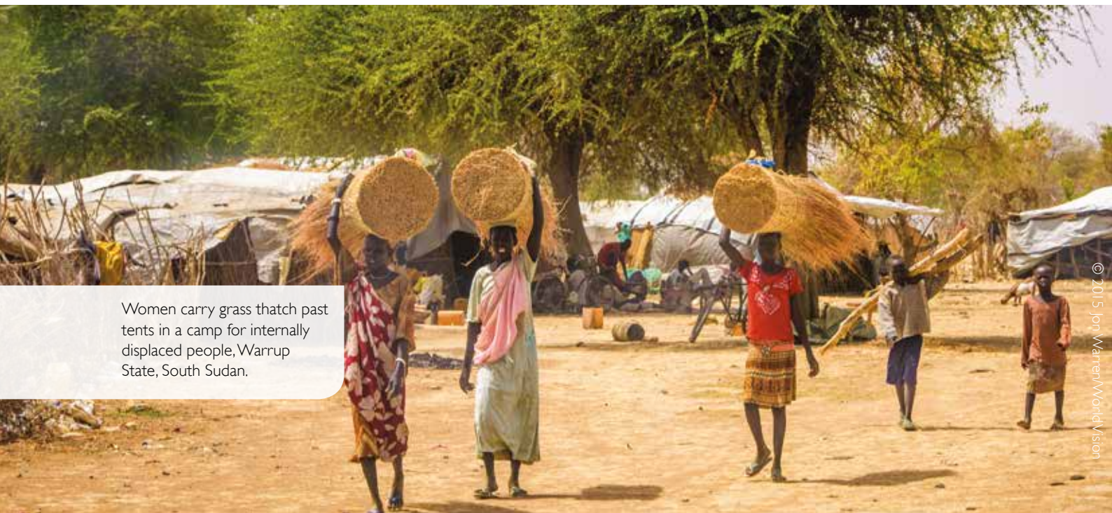
Women carry grass thatch past tents in a camp for internally displaced people, Warrup State, South Sudan.

This form of stigma is connected to deep-rooted societal and cultural beliefs. It mainly relates to the victim-blaming of female survivors; 'she was dressed inappropriately' or is guilty of marital infidelity. In communities where sex before marriage is reviled, female victims of rape are seen as no longer marriageable and pre-existing engagements are broken off. Mothers of children born of rape may be forced to marry any man willing to accept them, leaving them vulnerable to even further abuse.