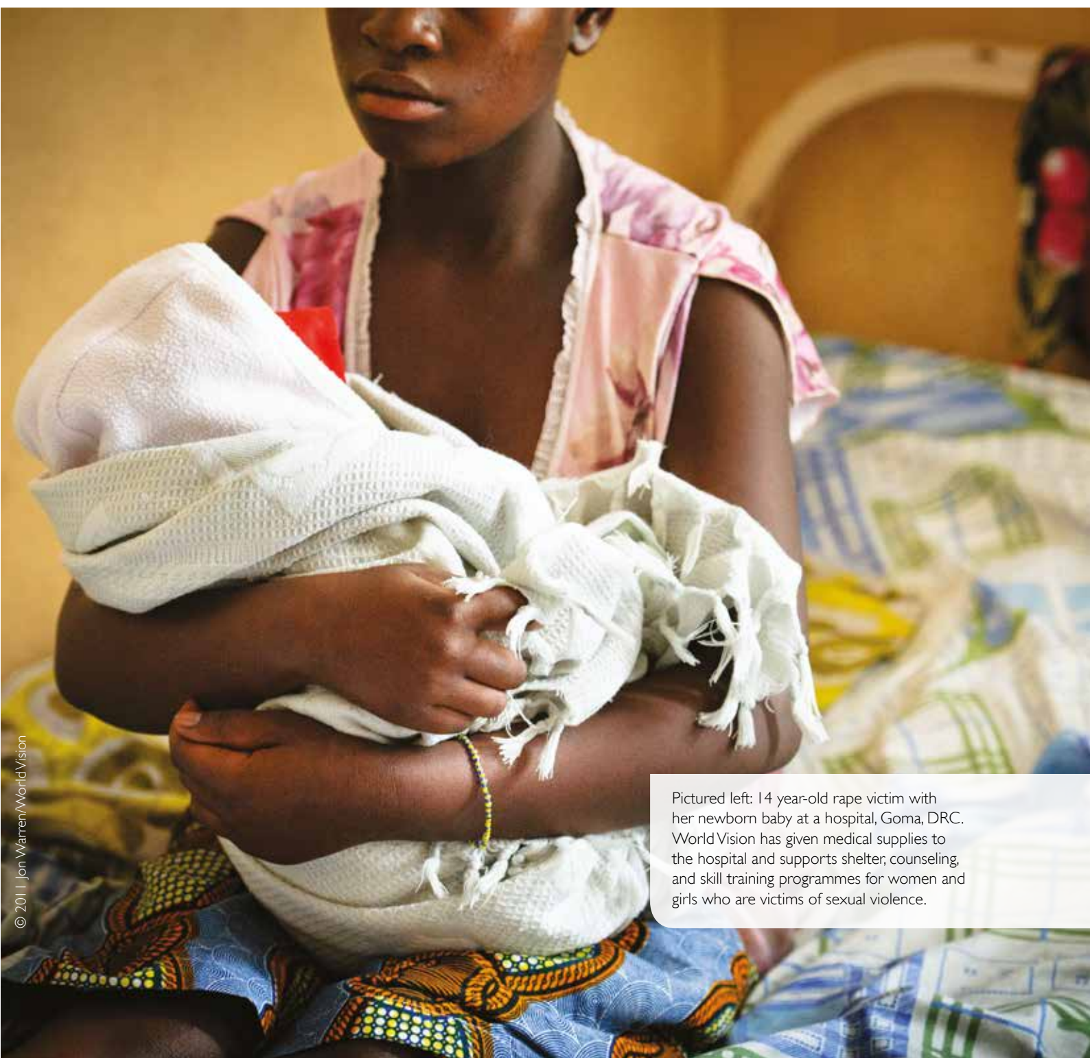
Pictured left: 14 year-old rape victim with her newborn baby at a hospital, Goma, DRC. World Vision has given medical supplies to the hospital and supports shelter, counseling, and skill training programmes for women and girls who are victims of sexual violence.

The specialist needs of children born of rape, believed to total more than 100,000, also commonly go unrecognised. Indeed, the stigma attached to their conception leaves life-long effects on these children, with many abandoned or viewed with suspicion or hostility by the communities to which they 'return.' It is both telling and heart-breaking that those conceived of rape during the Rwandan genocide of 1994 are known both to their mothers and wider community as 'children of bad memories.'