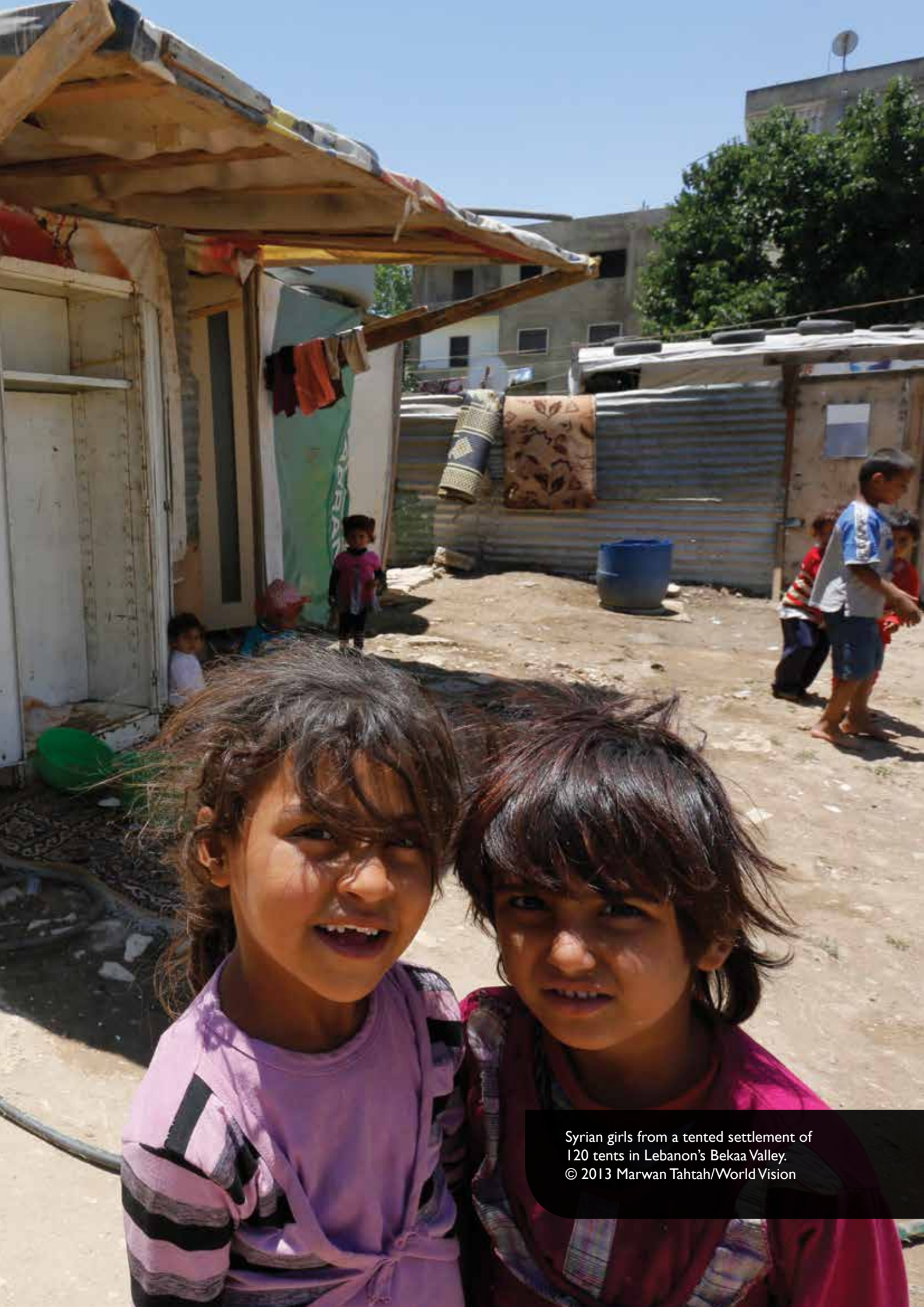
Syrian girls from a tented settlement of 120 tents in Lebanon's Bekaa Valley.