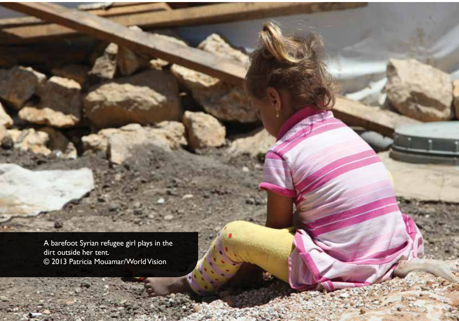
A barefoot Syrian refugee girl plays in the dirt outside her tent.

She is adamant that the government should set up camps for the Syrians.