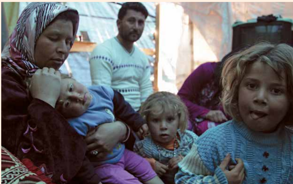
A Syrian woman cares for sick children. World Vision supports projects that enable Lebanese women to train Syrian refugee mothers on how to care for their children.

World Vision's Mothers in Action group was initially formed to work within poor Lebanese communities in the town of Kabalias in the Bekka Valley. Local women were trained in mother and child health and how to offer advice to other mothers. Access to healthcare was already poor in Kabalias before the Syrian crisis, which has seen the population of Bekka almost double, putting intense pressure on this already deprived community.