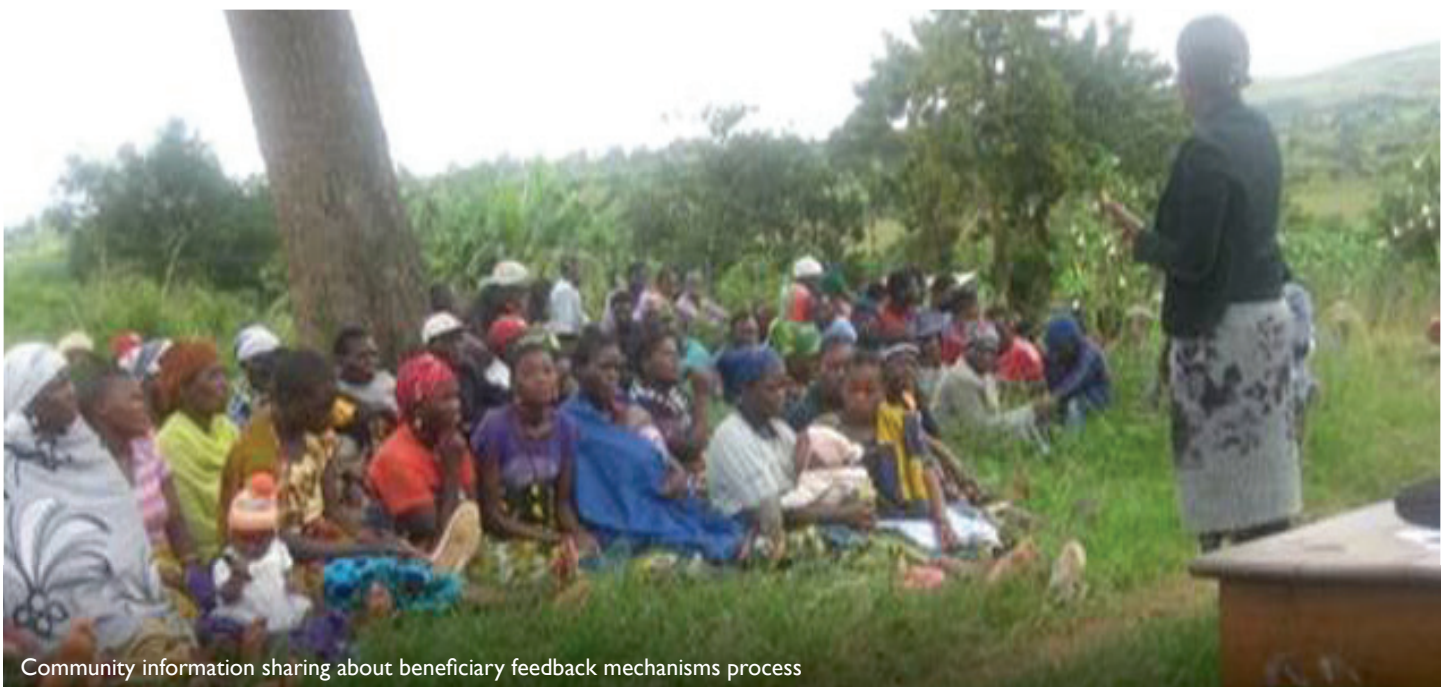
Community information sharing about beneficiary feedback mechanisms process

As the system developed, a need emerged for the CFO to have a single point of contact in government departments to refer feedback to and to find out what actions were being taken in response. The Departments of Health and Social Welfare have appointed focal points who actively engaged with CUAMM's CFO. Challenges with referring and tracking feedback persisted in departments that had not nominated a focal point. This demonstrated the value in having a focal person and suggests that, as far as possible, this should be planned for in setting up a BFM involving government stakeholders.