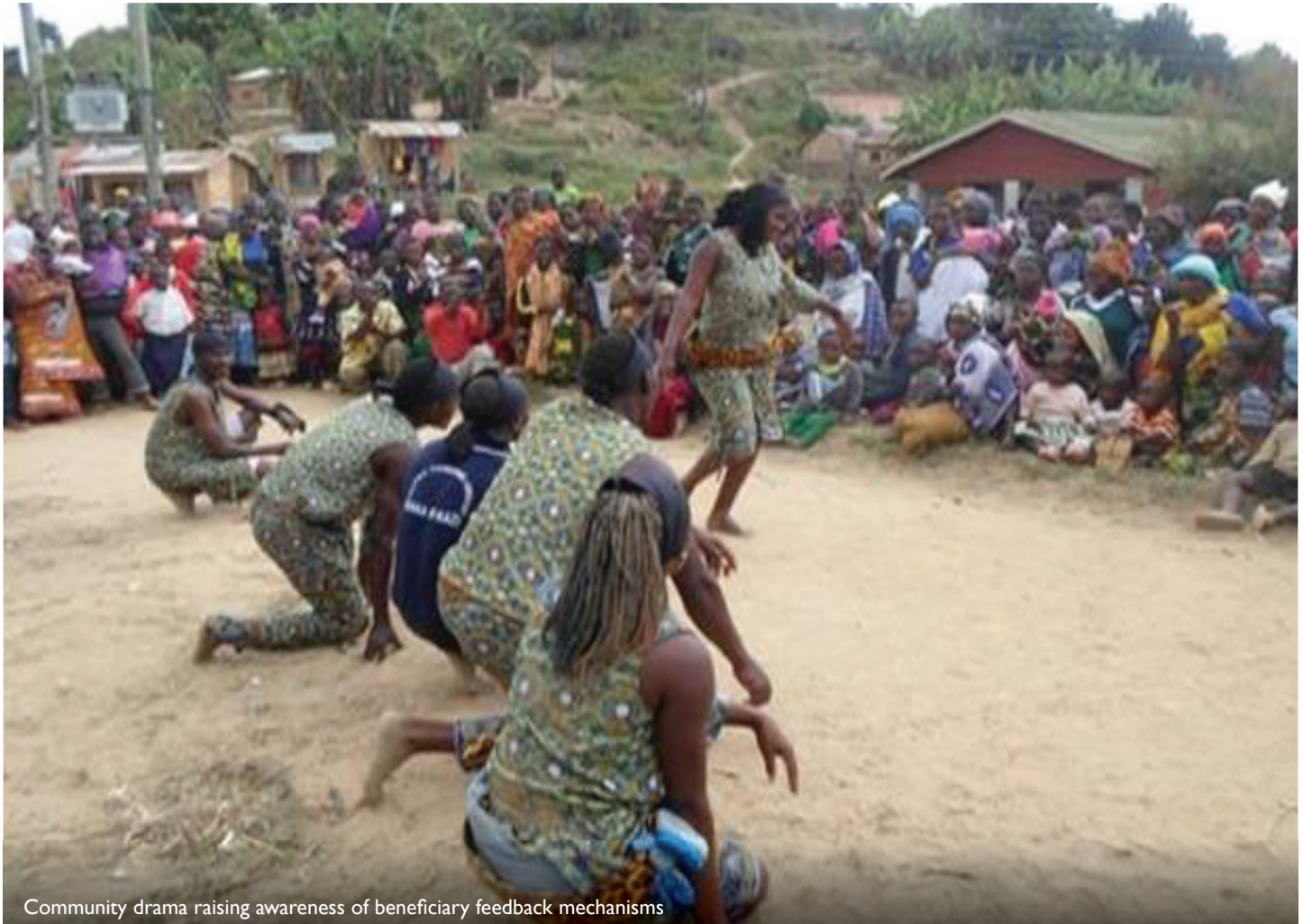
Community drama raising awareness of beneficiary feedback mechanisms

Doctors with Africa CUAMM is a leading Italian NGO in the field of healthcare cooperation. It piloted a Beneficiary Feedback Mechanism (BFM) in one of its rural maternal and child health projects in Tanzania, and used SMS and voice calls to receive ‘unsolicited feedback’ from the community.