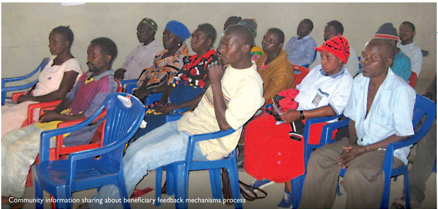
Community information sharing about beneficiary feedback mechanisms process