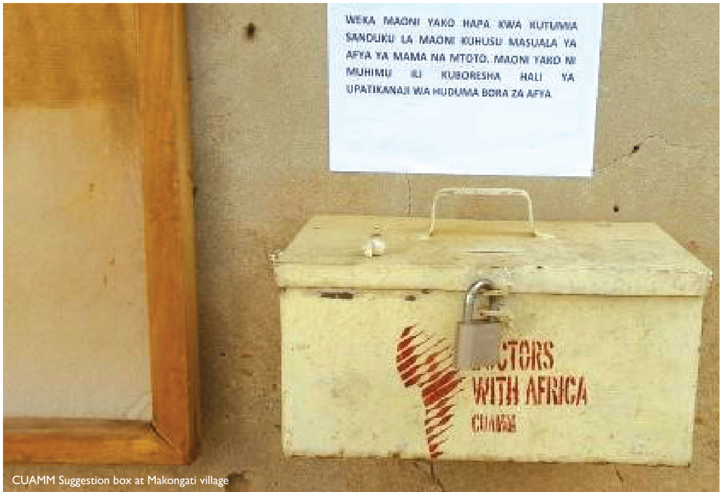
CUAMM Suggestion box at Makongati village

CUAMM is taking steps to both sustain and scale up the beneficiary feedback mechanism. It is integrating beneficiary feedback mechanisms into other projects, but adapting and changing the tools to make them more appropriate to the target populations (for example using community meetings). The multi-sectoral district level task force set up during this BFM pilot to address feedback will continue. Furthermore, CUAMM is advocating the district authorities to adopt Frontline SMS software to continue gathering feedback. CUAMM is also engaging national authorities (at Ministry and Regional levels) to adopt this methodology into their annual plans.