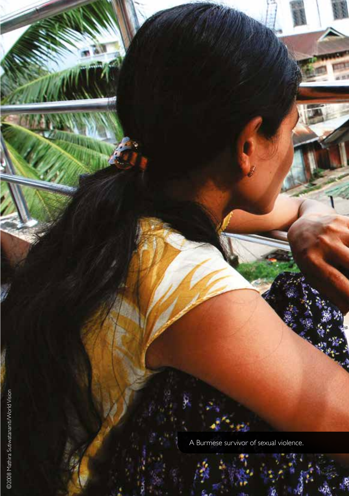
A Burmese survivor of sexual violence.