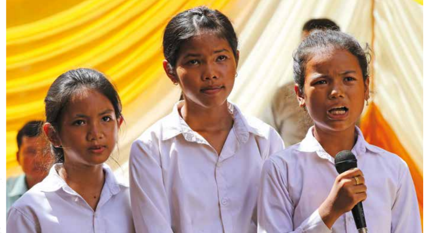
Above: Over 400 young people celebrated an International Children's Day at Krang Tarath primary school on May 31, 2019, to promote better protection from violence.